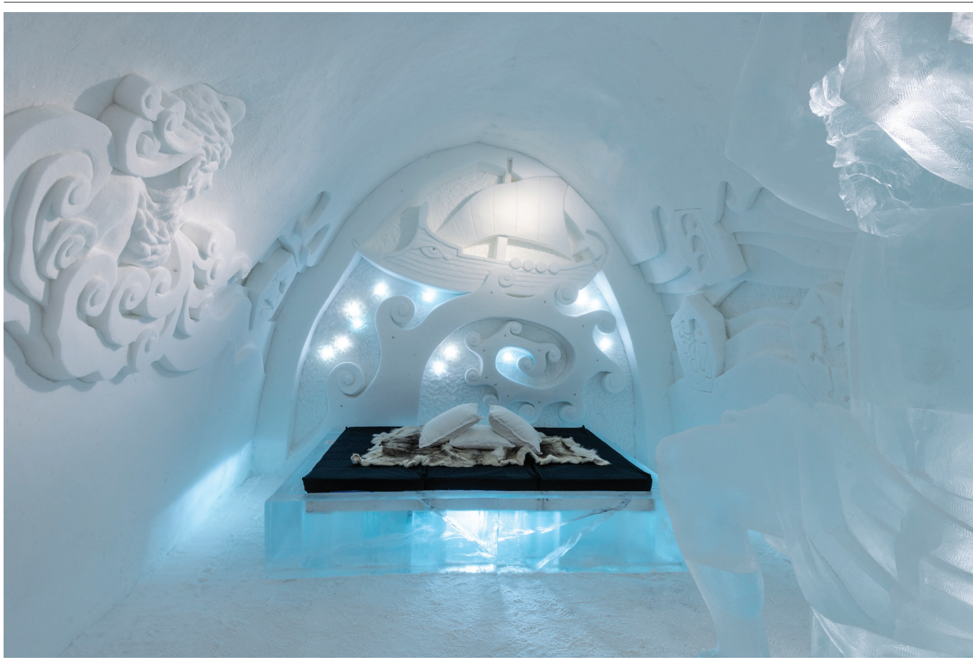
Art Suite "Antique Myths", Artists Viacheslav Iemelianenko & Bogdan Kutsevych